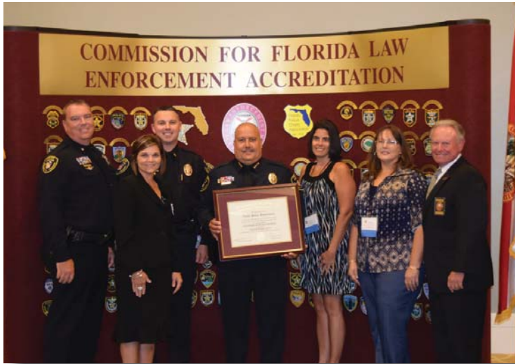
Cocoa Police Department