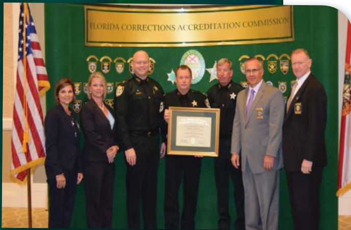
Clay County Sheriff's Office Detention Bureau

The next Florida Accreditation Conference is scheduled for October 6-7, 2015 at the Bonaventure Resort and Spa, Weston, Florida. We look forward to seeing you there.