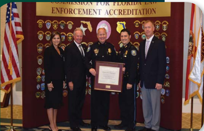
Gulfport Police Department