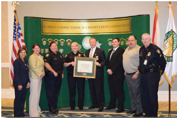
Jacksonville Sheriff's Office Department of Corrections