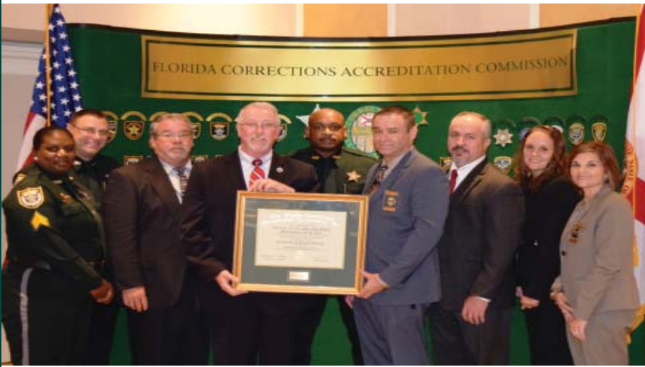
Alachua County Sheriff's Office Department of the Jail