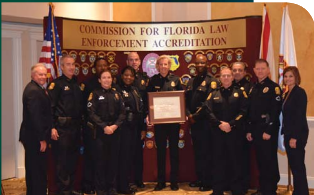
Tampa Police Department