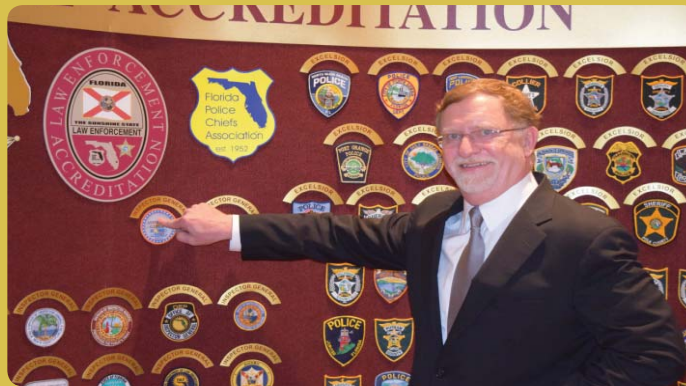
Broward Office of the Inspector General

Tampa Police Department Broward Office of the Inspector General Office of Financial Regulation, Office of the Inspector General