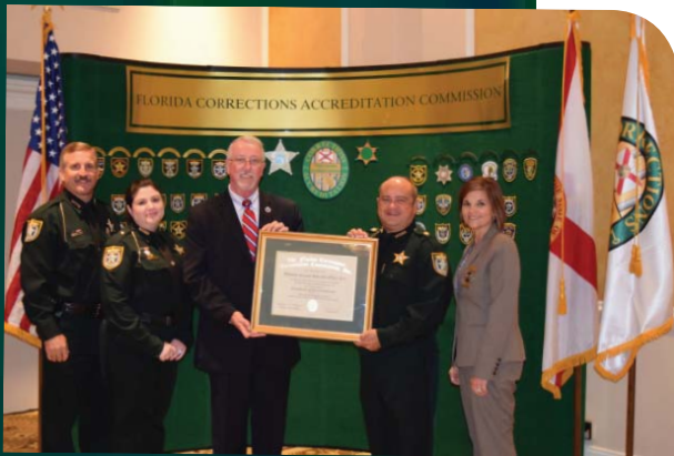
Wakulla County Sheriff's Office Jail

The next Florida Accreditation Conference is scheduled for February 23 - 27, 2015, at the Plaza Resort and Spa in Daytona Beach, Florida. We look forward to seeing you there!