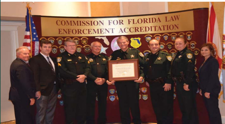
Escambia County Sheriffs Office